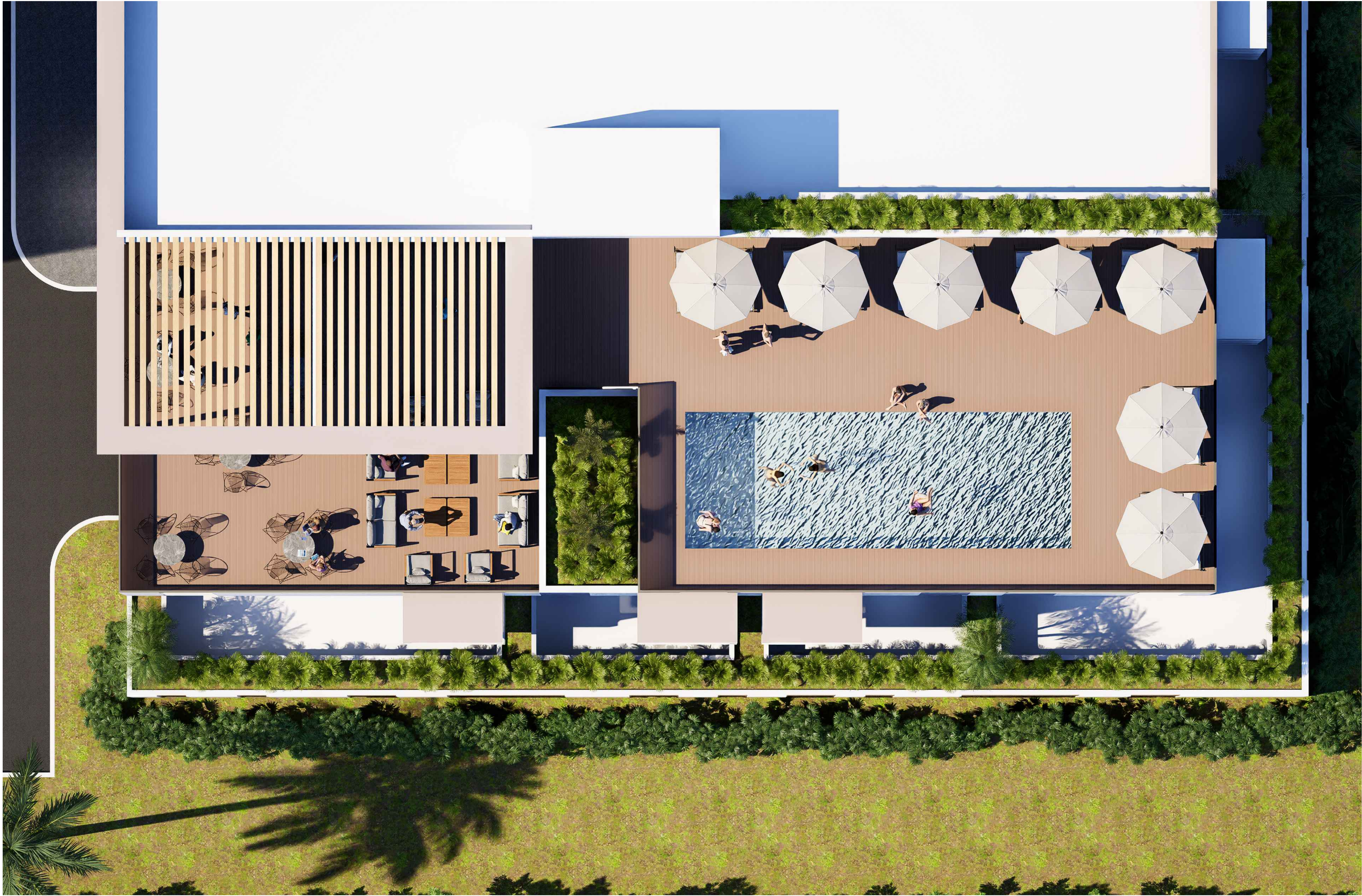
AERIAL VIEW OF THE ROOFTOP POOL DECK